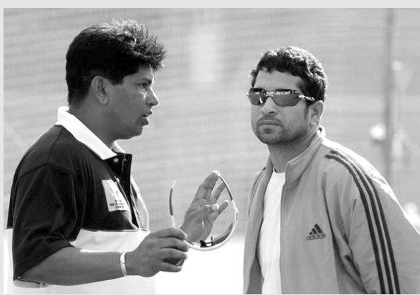
Chandrakant Pandit as coach interacting with legend Sachin Tendulkar.

In his scheme of things, planning and discipline are important ingredients. Honing of skills has added aim of assigning a role to each player to keep the game under control. His dictum fight till the last ball has gone down well with his wards.